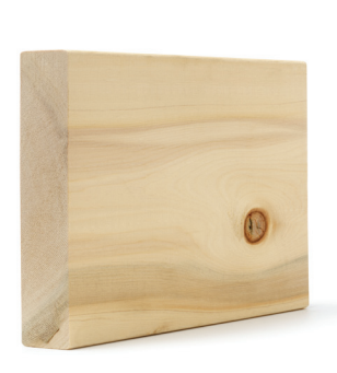
2" KNOTTY S4SEE